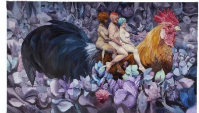
ROBERTO FABELO Viaje al jardín fantástico oil on canvas 80 ¾ x 140 ¼ in Price Realized: $399,000