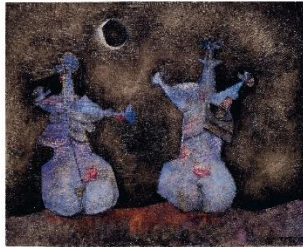
RUFINO TAMAYO Dos amantes contemplando la luna oil on canvas 31.87 x 39.33 in Price Realized: $2,295,000