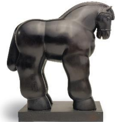
FERNANDO BOTERO Horse bronze 38 ¾ x 37 x 20 in Price Realized: $591,000