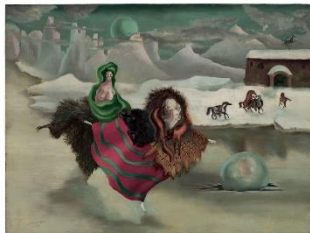
PROPERTY FROM THE ESTATE OF JACQUELYN MILLER MATISSE LEONORA CARRINGTON La joie de patinage (The Joy of Skating) oil on canvas 18 x 24 in. Price Realized $519,000