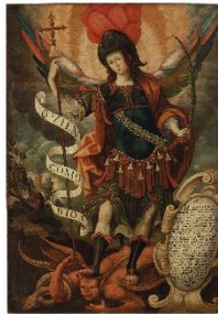
LUIS DE RIAÑO Saint Michael Archangel oil on canvas 81 x 56 in Price Realized: $495,000